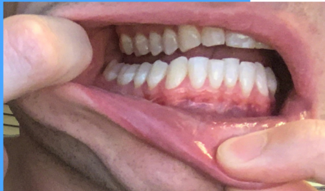
Bottom left, cheek side