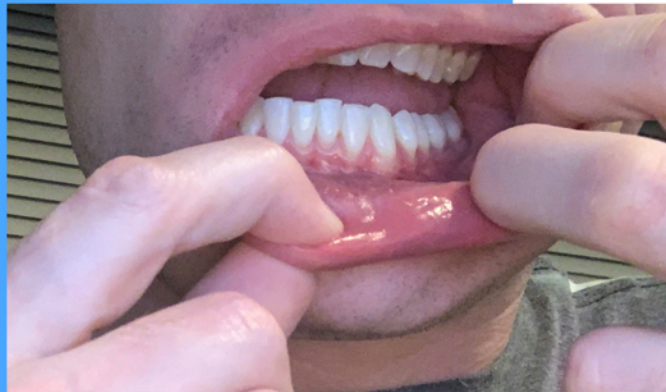
Bottom right, cheek side