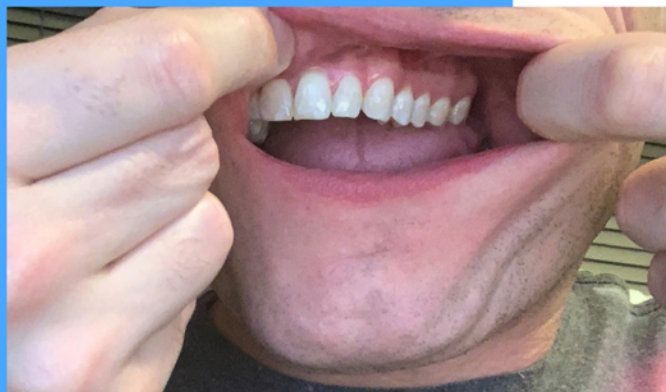
Top right, cheek side