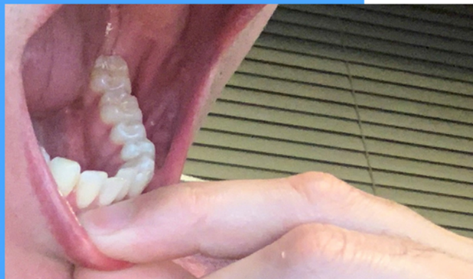
Bottom right, tongue side