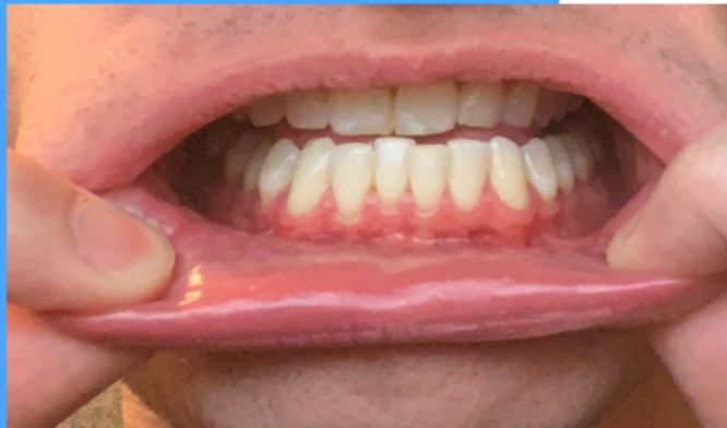
Bottom teeth, lip side