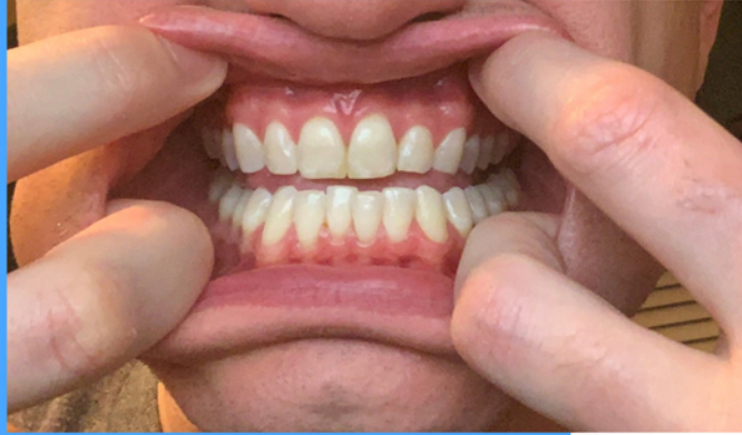
Front teeth, lip side