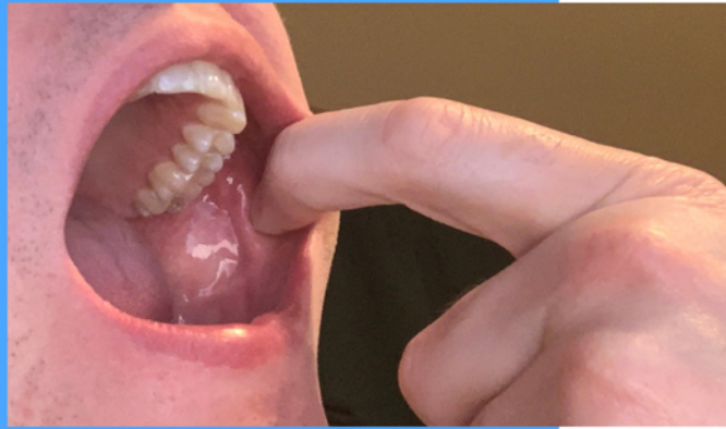
Top right, tongue side