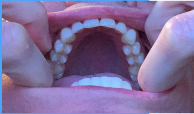
Top front teeth, chewing side