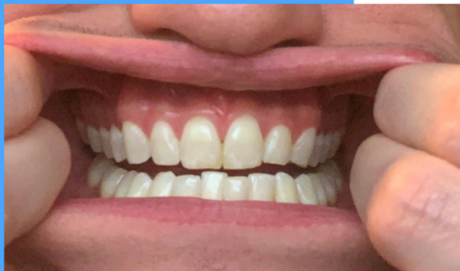
Top teeth, lip side