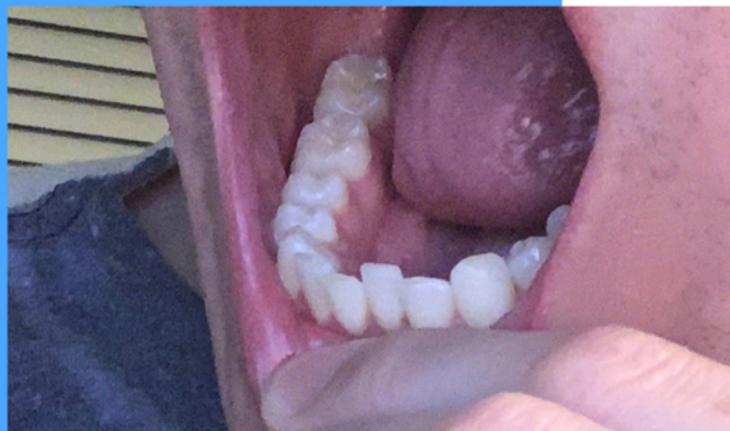
Bottom left, tongue side